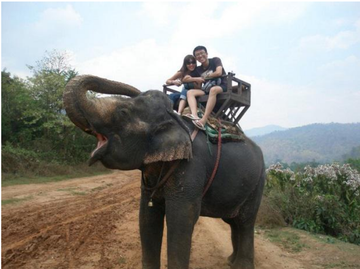
My paid for stay in Chang Mai (Thailand) in 2011 (a survey contest that I attracted)